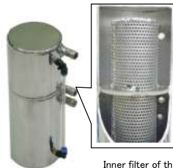
Inner filter of the

*There are two type: 15Φ and 9Φ for Street model, competition model.